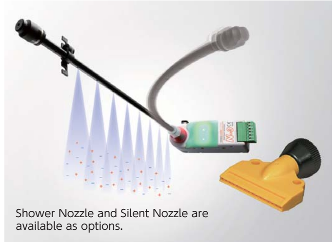
Shower Nozzle and Silent Nozzle are available as options.

Interchangeable nozzles for various applications (option)